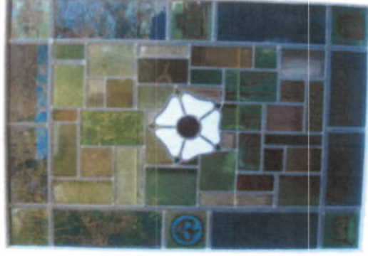
Newly restored stained glass window

Methodist – Thorganby Village, telephone contact 01904 702223