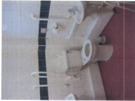
Disabled Guests' Wet Room

White Rose House can accommodate a maximum of 100 people for daytime meetings and can sleep up to 30 people (including adults), on camp beds.